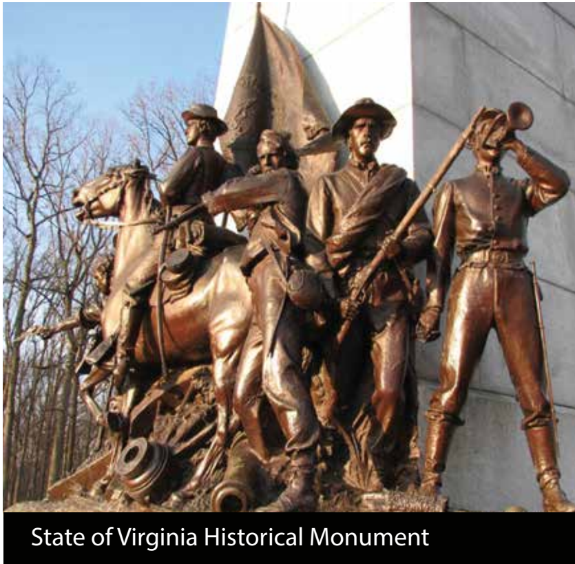
State of Virginia Historical Monument