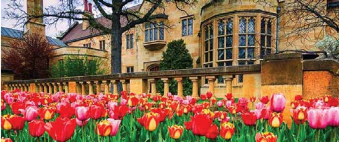
Paine Art Center & Gardens