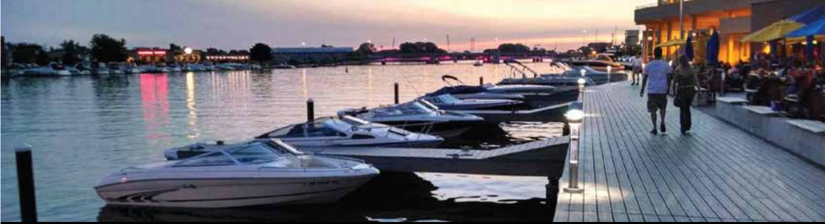
Pioneer Drive Park along the shore of Lake Winnebago